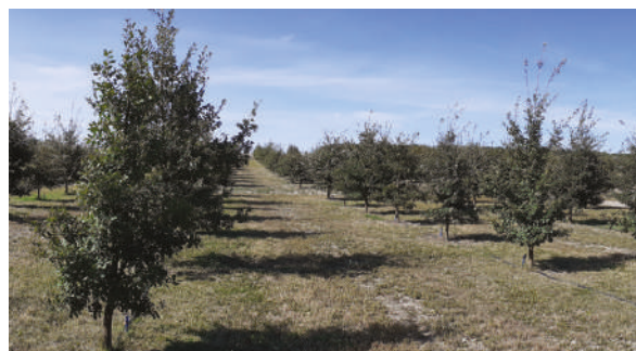
Plantation of ROBIN truffle plants which produced its first truffles after 4 years, Planting distance 4 m x 6 m, the soil is tilled every year in March.

Our ROBIN truffle plants are guaranteed 80% recovery, and when protected by a climatic sheath and cork or plastic mulch, the guarantee is increased to 100%.