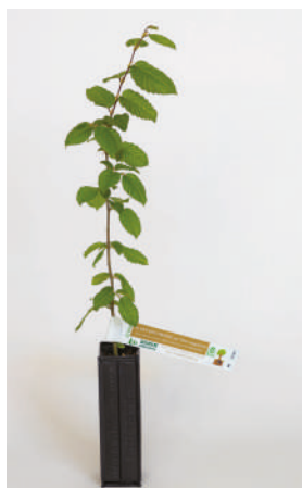
Robin Carpinus betulus truffle tree in mycorrhizal association with Tuber magnatum