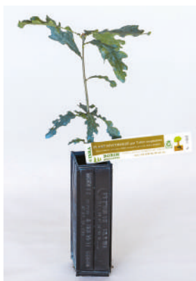
One-year-old Robin Quercus pubescens truffle tree in mycorrhizal association with Tuber magnatum, cultivated in ROBIN ANTI-CHIGNON® R430cm3 pot