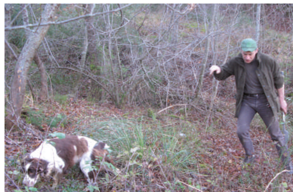
Mr. Emidio Angellozzi in a natural Tuber magnatum harvesting are located in the Marche region (Italy).

T. magnatum thrives in dense vegetation where the soil is always shaded. These conditions promote constant soil moisture in all seasons, which is a determining factor. This biotope is relatively different from that where T. melanosporum is found.