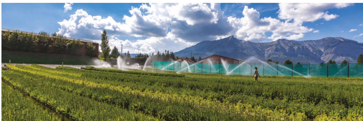
Robin Pépinières, Saint Laurent du Cros site (05500)