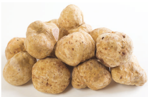
Tuber magnatum Pico

T uber magnatum Pico, known as Piedmont White Truffle or Italian White Truffle, is the rarest and most expensive truffle. It is harvested exclusively from the forests of a few European countries, but the supply often fails to meet the strong global demand for this fungus. From 1999, Pépinières Robin, in partnership with INRAE, began to work on mycorrhisation with Tuber magnatum . After 9 years of joint research between INRAE and Pépinières Robin, the first truffle plantations intended for its cultivation were created in France in 2008.