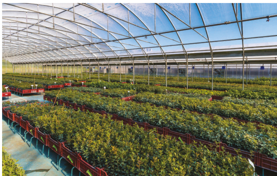
One of our ROBIN truffle oak production greenhouses on our Valernes farm (04200)