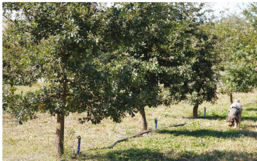
Plantation of ROBIN truffle plants which produced its first Tuber magnatum at the age of 4 years.

This world first with the 1st controlled production of Tuber magnatum under truffle plants outside the natural geographical range of this truffle confirms the position of Pépinières ROBIN as a world leader in the field of controlled mycorrhization.